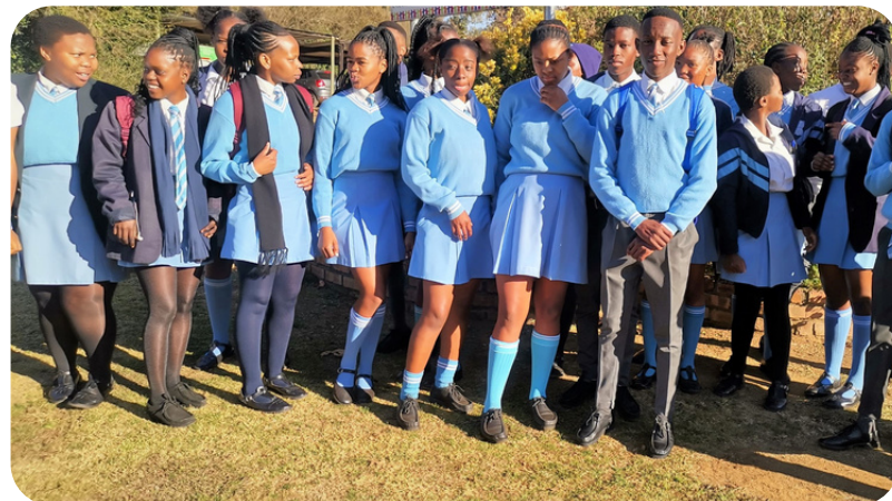
Asithuthuke Combined School grade 11 students are pictured at Midlands Community College after attending Google Digital Skills classes on day one.

Students from Asithuthuke Combined School's 11th grade had a profound five-day experience at Midlands Community College. They used Google Digital Skills to learn how to navigate the Google suite. Some students had never heard of Google suite before taking the computer class; as a result, they gain from such initiatives in terms of learning.