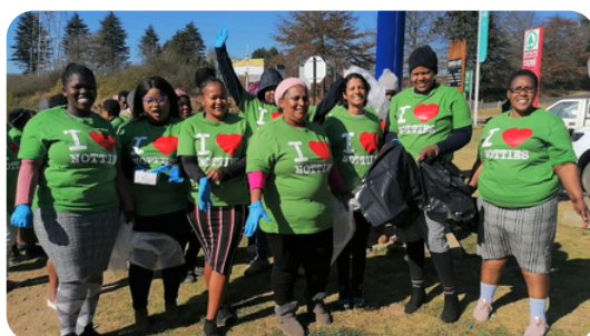
Midlands Community College staff, Estendeni residents, and Love Notties cleaning in and around town on Mandela Day.

Midlands Community College took to the streets to commemorate Mandela Day for 67 minutes. The MCC staff and Estendeni residents collaborated with Love Notties to clean up our neighborhood.