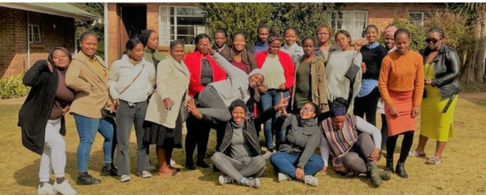
Pictured are interns from MCC, Letsee, Lima, and HPSA who attended First Job training at Midlands Community College.

MCC was thrilled to welcome seven new interns in July. First Rand Ltd has made a significant contribution to First Job Skills Development. We have more hands on deck across the board, and we are excited to incorporate their creative ideas into what we do.