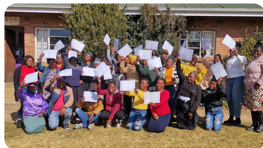
While learning through play, these critical personnel gained sufficient skills and knowledge.

In July, the ECD department ran a Solon Foundation-funded training workshop for non-teaching staff at ECD centers.