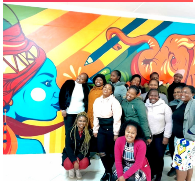
Midlands Community College employees pose for a photo on Women's Day.

Midlands Community College stood up on Women's Day, respectfully standing alongside all women everywhere. We recognize your journeys and share your hopes for a brighter future.