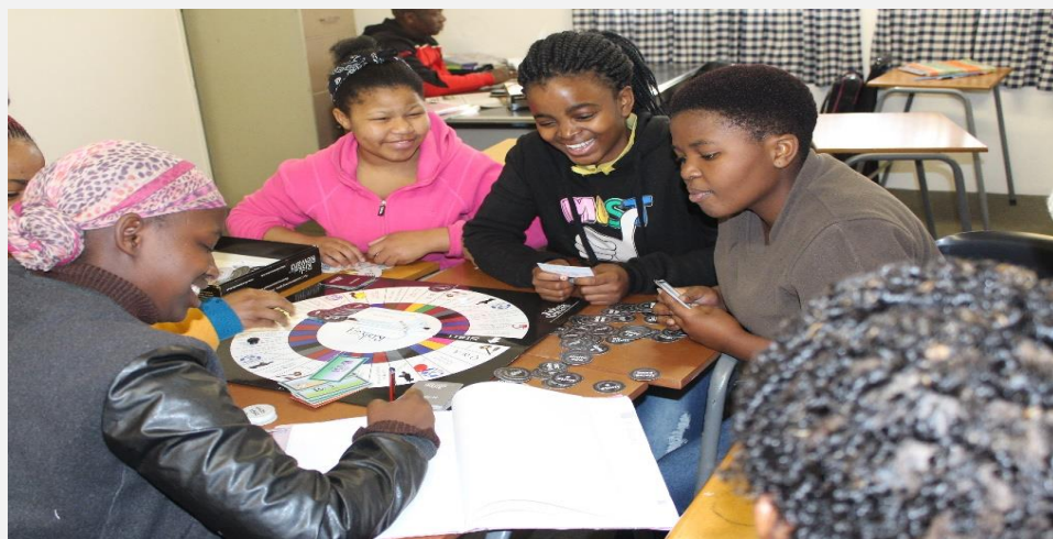
Accounting Students enjoying their Board Game by Risk and Reward