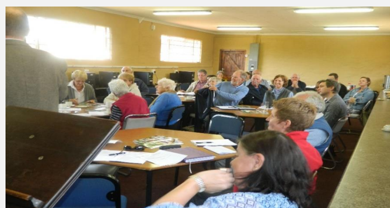
AGM held on the 17 th of August 2015 in MCC's upgraded Resource Centre.....