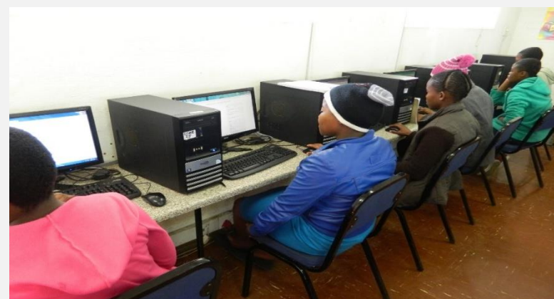
A Few of 200 students who attended holiday school during June holidays doing computer course (ICDL) for the first time.

My heart is still in medicine and I've planned to enrol at Wits for the year 2017. Having done well in my trials and final exams at MCC, so many doors opened, but my passion was in health sciences. Yes-sponsors from the UNITE programme and various bursaries came from different sectors that MCC had organised for us, but my heart was covered in white coats. My advice is always, that when choosing a career path, choose wisely because ultimately that's where you'll be for almost the rest of your life, Find something that intrigues you - something you love - maybe your childhood dream... Money isn't always everything.